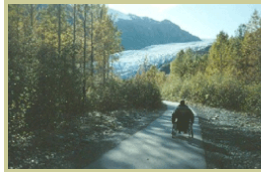
An accessible trail is a trail that is accessible to and usable by people with disabilities.

Previous accessibility standards such as the Uniform Federal Accessibility Standards (UFAS) and the Americans with Disabilities Act Accessibility Guidelines (ADAAG) address the built environment, "the bricks and mortar." These guidelines do not transfer well to the natural environment. The built environment is open to manipulation. For example, if there is a hill where someone wants to build the parking lot for a store, then a bulldozer is used to level the area. In contrast, the natural environment includes factors, such as the weather, that are out of human control. The natural environment is part of the experience people wish to enjoy on a trail.