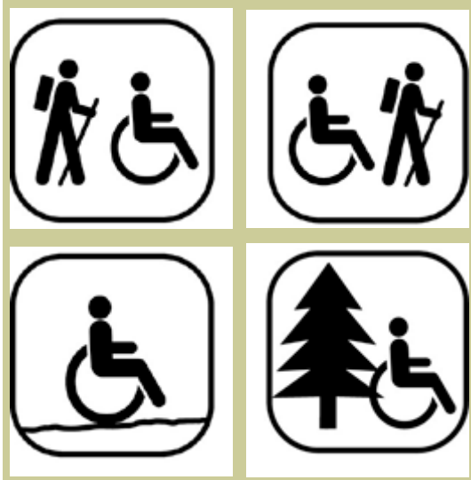
Examples of symbols that could be used to represent a trail that fully complies with Section 16.