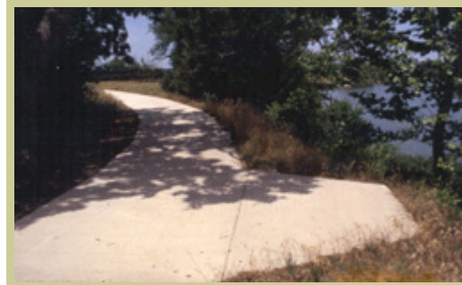
(Bottom) Resting intervals must be 60 inches minimum in length, and have a width as wide as the widest portion of the trail segment leading to the resting interval.