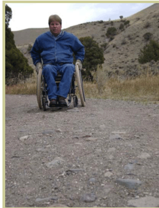
Tread obstacles may be three inches maximum where running slopes and cross slopes are a maximum of 1:20, unless one or more of the conditions for departure apply.