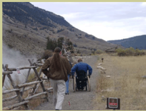
Accessible routes, outdoor access routes, and trails are all paths that have varying requirements based on their purpose.

One of the challenges the committee faced was building consensus on criteria for accessible trails. Trails provide unique outdoor experiences that at times may be difficult to make accessible while maintaining the natural elements. Accessibility requirements vary for each individual. For example, a person who uses a manual wheelchair with a strong upper body may be able to easily transverse slopes that a mother pushing a stroller could have difficulty maneuvering. In other words, useable does not necessarily indicate accessible.