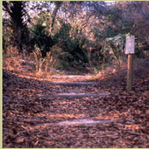
Examples of tread obstacles include tree roots, rocks, brush, downed trees or branches projecting from the trail.