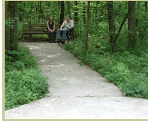
(Top) An example of a resting area designed a few feet from the main traffic of the trail, providing an area for meditation and conversation.

The ninth guideline regarding edge protection states edge protection is not necessarily required, however where it is provided, it must have a minimum height of 3 inches.