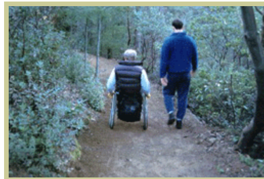
A clear tread width of a minimum 36 inches allows a wide enough area for a person using a wheelchair to comfortably stay on the trail.

The next provision involves clear tread width, or the unobstructed width of the trail. The clear tread width of an accessible trail must be a minimum of 36 inches. This allows a wide enough area for a person using a wheelchair or scooter to comfortably stay on the firm and stable trail surface.